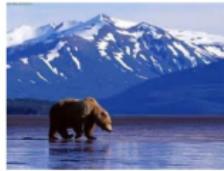
1st Charity Prize Alaskan Cruise