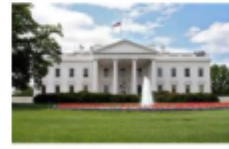
4th Patriotic Prize Washington D.C.