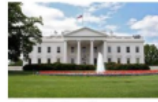
4th Patriotic Prize Washington D.C.