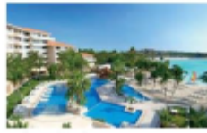
3rd Fraternity Prize Cancun