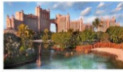
2nd Unity Prize Atlantis Paradise Island